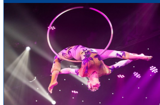
"ARRAY" - Pigeon Forge's Newest Variety Show

Day 7: Today, after enjoying a Continental Breakfast, you depart for home... a perfect time to chat with your friends about all the fun things you've done, the great shows you've seen and where your next group trip will take you!