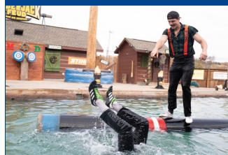
PAULA DEEN'S LUMBERJACK FEUD SHOW