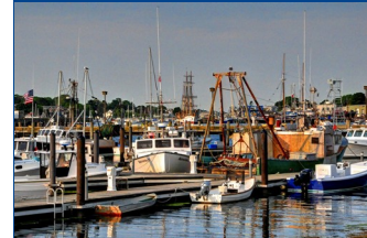
Historic Gloucester "America's Oldest Seaport"