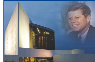
JFK Library & Museum