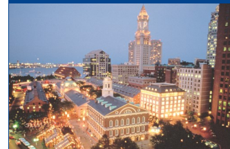
Faneuil Hall Marketplace