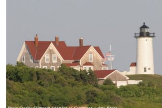
Lighthouse overlooking Vineyard Sound