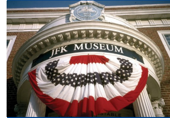
Visit to the JFK Museum