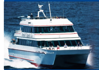
Mackinac Island Ferry