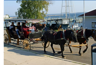
Tour Mackinac Island by Horse and Carriage