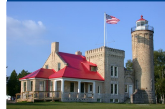
Mackinac Point Lighthouse