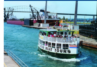
Soo Locks Cruise in Sault Sainte Marie